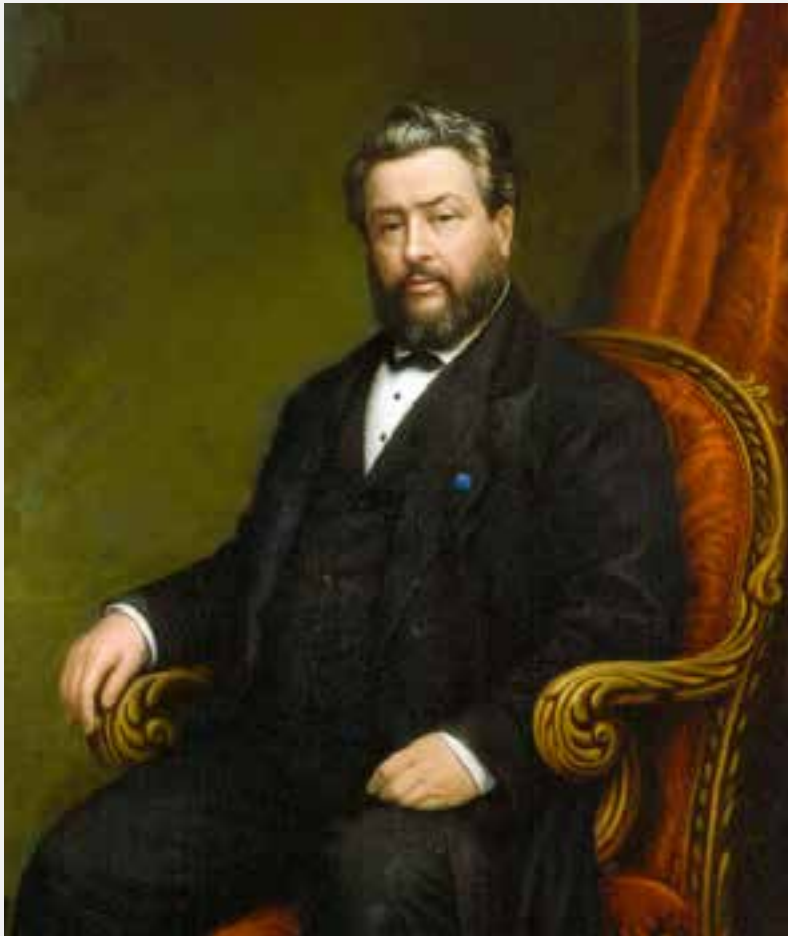
Charles Spurgeon (1834-1892)